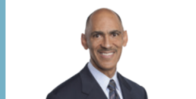
TONY DUNGY Former NFL coach and Author