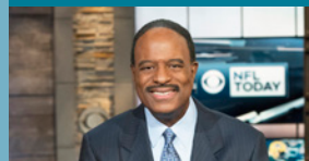
JAMES BROWN TV Host & Broadcaster